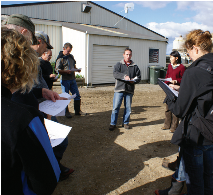
How farmers respond to climate change was the focus of a recent SFF project in the Bay of Plenty.